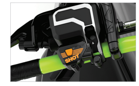
6 E-TEC SHOT starter

The high-resolution infotainment system that provides an intuitive experience for riders, now with built-in GPS and maps for navigation without connecting a phone.