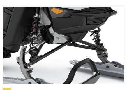
4 High-quality KYB shock package

Extremely capable high-pressure gas shocks by