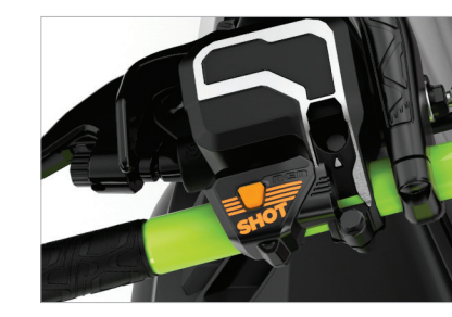
6 E-TEC SHOT starter

With 90% new parts, this complete redesign increases capacity and reduces weight by 2.5 lb.