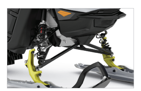
4 High-quality KYB shock package

Extremely capable high-pressure gas shocks by