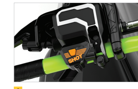
6 E-TEC SHOT starter

With 90% new parts, this complete redesign increases capacity and reduces weight by 2.5 lb.