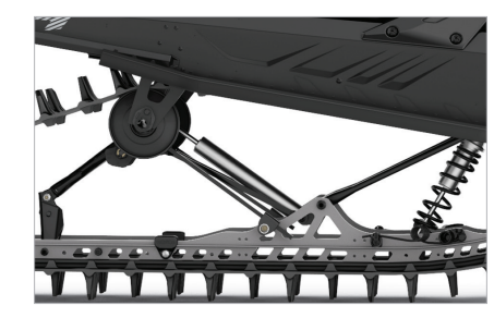
5 tMotion X rear suspension

Extremely capable high-pressure gas shocks by