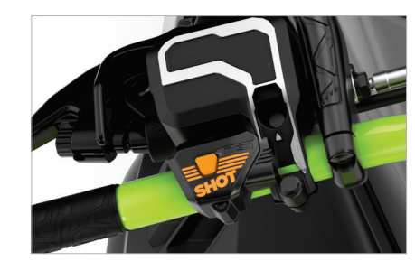
6 E-TEC SHOT starter

The high-resolution infotainment system that provides an intuitive experience for riders, now with built-in GPS and maps for navigation without connecting a phone.